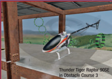
Thunder Tiger Raptor 90SE in Obstacle Course 3