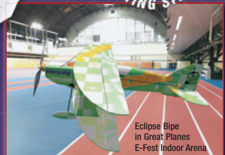
Eclipse Biplane in Great Planes E-Fest Indoor Arena