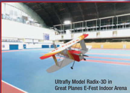
Ultrafly Model Radix-3D in Great Planes E-Fest Indoor Arena