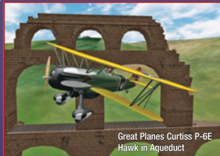
Great Planes Curtiss P-6E Hawk in Aqueduct